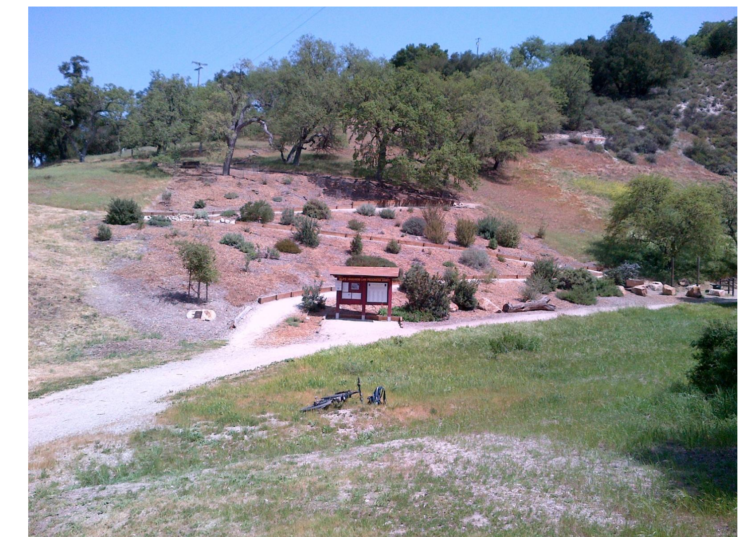
Stadium Lane in September 2011

The Atascadero Land Preservation Society (ALPS) is a local, non-profit, 501(c)(3) conservation organization founded in 1989 whose mission is to preserve environmentally significant open space and natural land located in Atascadero, California.